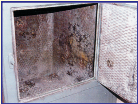
Fiberglass HVAC insulation particles in the airstream