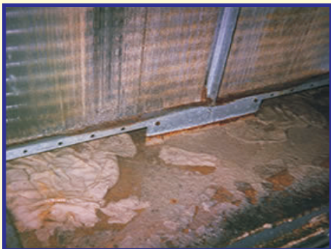
Dirt and biological fouling in the HVAC condensate pan

Particulates in your building airstream can cause all sorts of problems. We have advanced products to help remedy the situation.