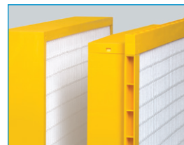
Available in both box style and single header design