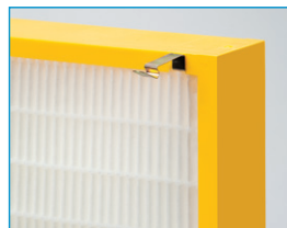
Shown with 2" clip designed to hold an optional pre-filter